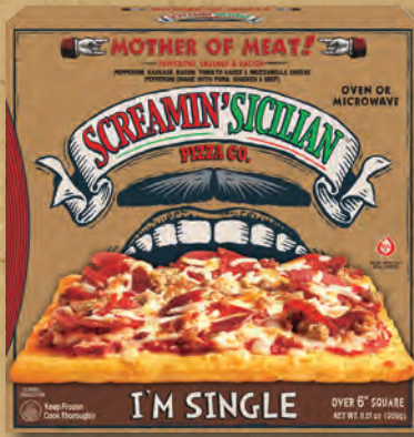
MOTHER OF MEAT! (PEPPERONI, SAUSAGE & BACON) Pepperoni*, Sausage, Bacon, Mozzarella Cheese, Tomato Sauce