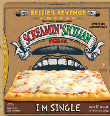
BESSIE'S REVENGE (CHEESE) Mozzarella Cheese, Tomato Sauce