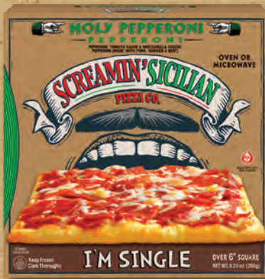
HOLY PEPPERONI (PEPPERONI) Pepperoni*, Mozzarella Cheese, Tomato Sauce