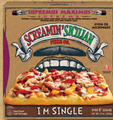
SUPREMUS MAXIMUS (SUPREME) Pepperoni*, Italian Sausage, Onions, Yellow & Red Bell Peppers, Mozzarella Cheese, Tomato Sauce