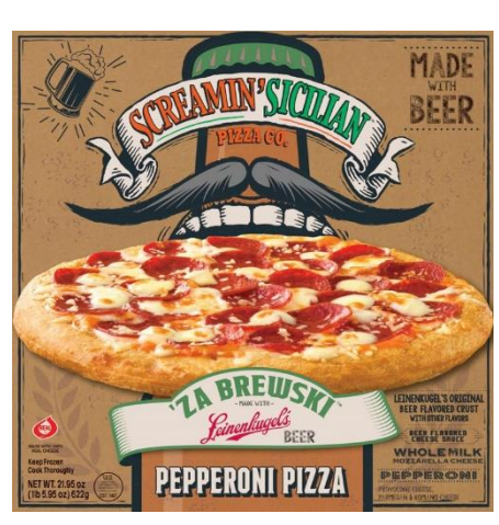
Screamin' Sicilian 'Za Brewski Pepperoni Pizza

With suggested retail price of $8.99, Screamin' Sicilian 'Za Brewski pizzas with Leinenkugel's Original-infused crust can be found at the following retailers: Piggly Wiggly, Woodman's, Jewel, Sendik's, Festival